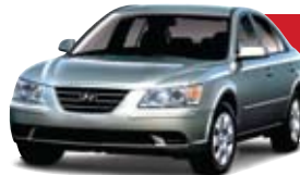
'09 Kia Spectra EX 4DR 38,000 - 44,999 miles